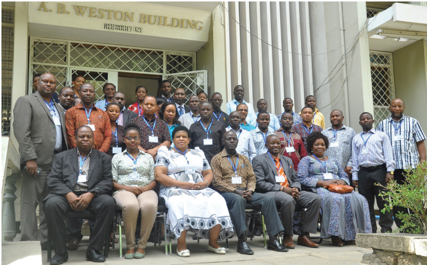
Plate 1: NFCS workshop participants posing for a group photo during the National stakeholders' consultation workshop, Dar-es-Salaam on 10th January, 2017