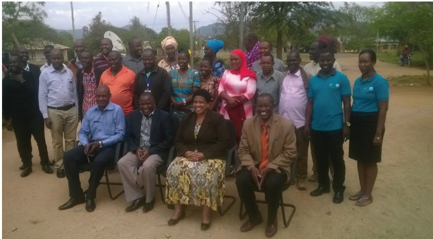
Plate 2: NFCS workshop participants posing for a group photo during the District level stakeholders' consultation workshop in Kiteto district on 23rd February, 2017